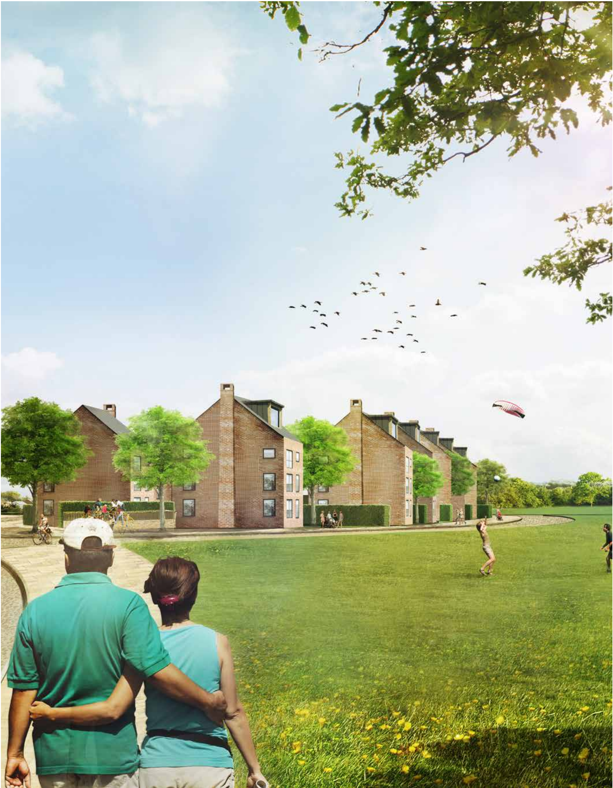
Village 3, frontage to landscape - based upon Illustrative Concept Masterplan